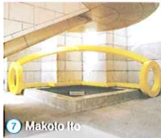
7 Makoto Ito

Bollards, benches, signs, streetlights, sprinkler heads, ventilation ports: functional features have been transformed by these artists' hands into beautiful, disturbing, and mysterious objects. These works of art, now familiar presences integrated into the neighborhood, connect with people and get close to them, displaying many different faces.