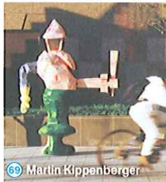
69 Martin Kippenberger

This neighborhood, with works of art by 92 artists from 36 countries, working with different ways of thinking, materials, and techniques, is a mirror on the diversity of the Weltgeist or world spirit in the late twentieth century. Here you will find many works by Donald Judd, Martin Kippenberger, and other famous artists whose names come up again in the history of art.