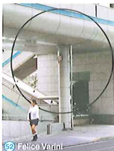
52 Felice Varini

The artworks deliberately lack labels of any sort. Make contact with them directly, as your own senses dictate, while you are exploring the neighborhood. You'll meet unexpected works of art in unexpected places—at the side of the road, between trees lining a street, on the walls of a building. The discoveries awaiting you include works that look very different in night and day, for fascinating nightscapes only an urban setting can offer.